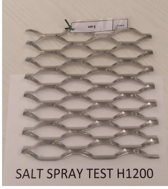
After 1200 hours of Salt Spray Solution treatment: Date: 01/06/2015; Time: 08:00